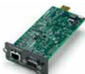
Liebert® Intellislot® Communication Card