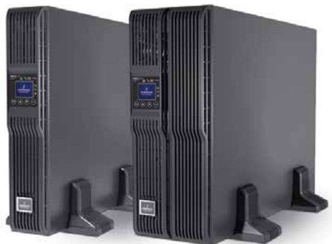
Liebert® GXT4™ 700 - 3000 VA