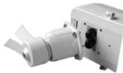
Easy mounting of the bracket with only 4 allen head screws