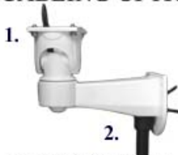
Two Cable options as shown