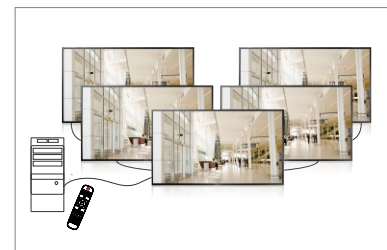
RS-232/ RJ45/IR for remote control