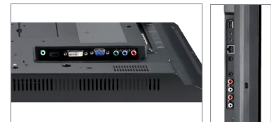
Versatile connectivity: VGA, DVI, HDMI, Composite, Component