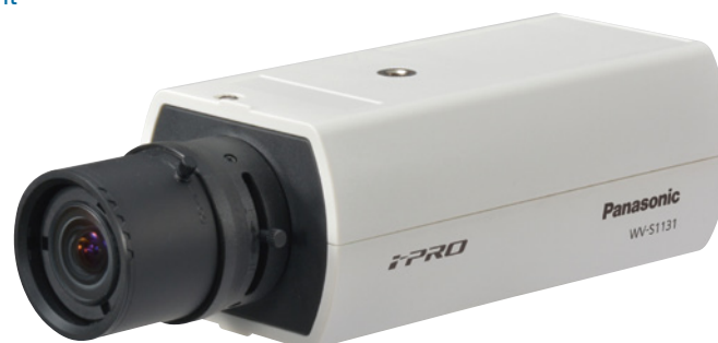
Lens : Optional